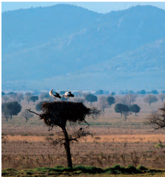
Cabañeros National Park.