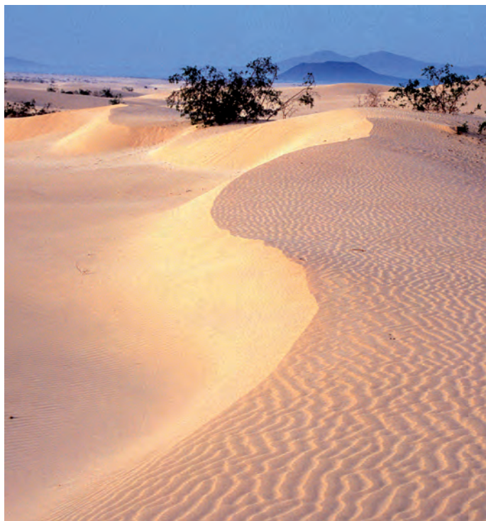
Dunas de Corralejo Nature Reserve. Fuerteventura.