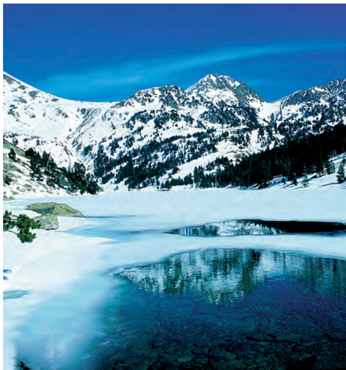
Aigüestortes i Estany de Sant Maurici National Park.