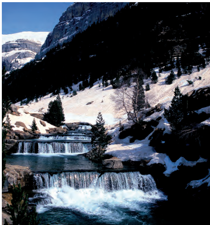
Ordesa National Park.