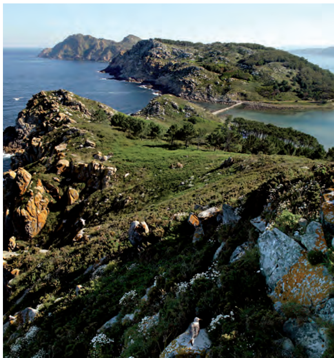
Islas Atlánticas National Park.