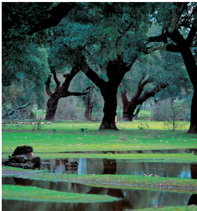
Monfragüe National Park.