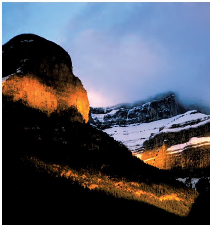
Ordesa National Park.