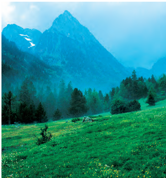
Aigüestortes and Estany de Sant Maurici National Park.