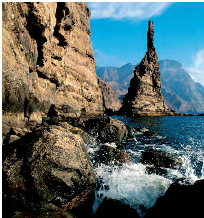
Tamadaba Nature Park, Las Palmas (Agaete).