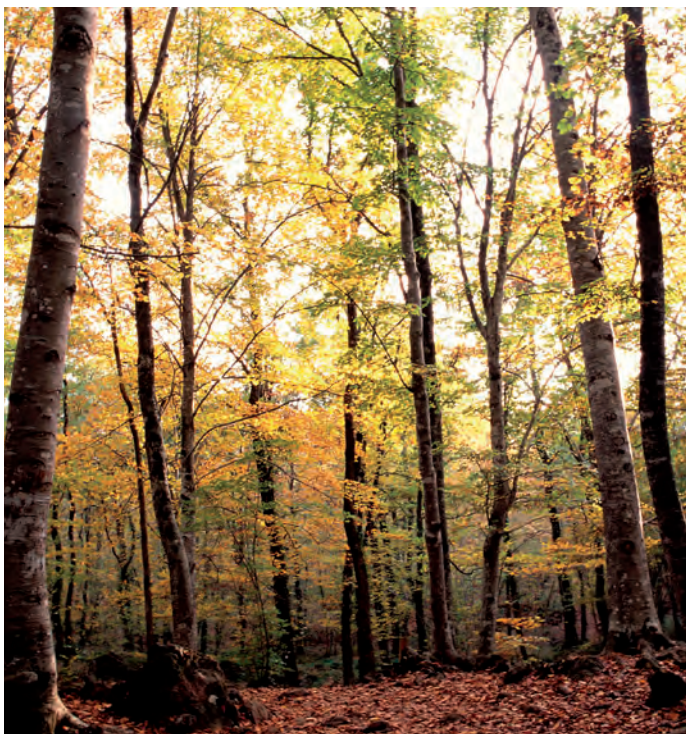
La Garrotxa Nature Park. Fageda d'en Jordà.