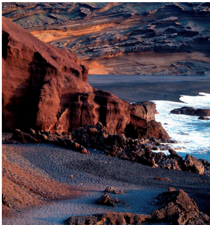
Timanfaya National Park.