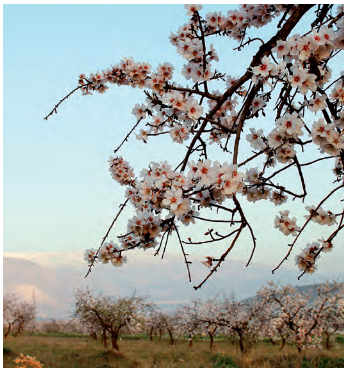
Sierra Nevada National Park.